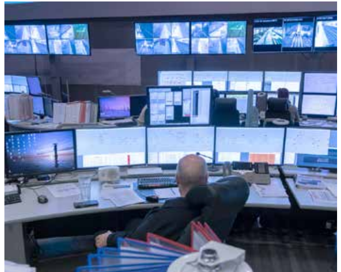
Mipro's ATS Automatic Train Supervision and control system ensures flexible and user specific traffic visualisation.